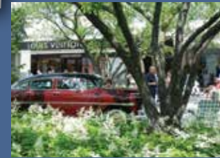
Father's Day Classic Car Show